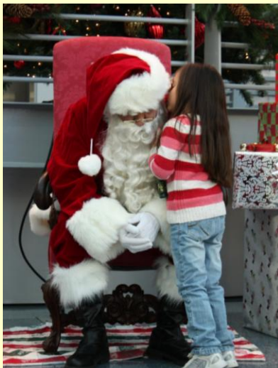
Visitors and staff shared their secrets with Santa, who tends bar in Tun Tavern in the off-season.