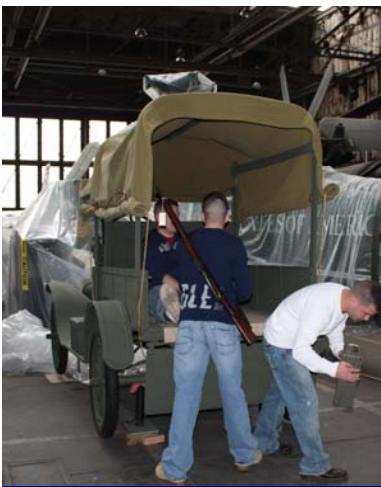
Establishing shots were taken to determine how to pose the models.

Talented exhibit specialists are creating 12 cast figures for the next galleries. Ten Quantico-based Marines covered in blue "goo" and plaster posed for hours so that exhibit fabricators from Taylor Studios, Inc., could accurately mold their bodies.